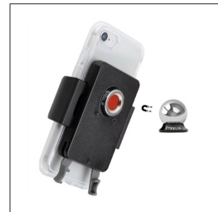
Steelie Squeeze Dash Kit