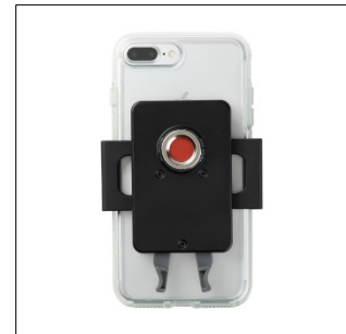
Steelie Squeeze Clamp

The Steelie Squeeze Clamp secures virtually any phone with a case and accessories, featuring inner continuous force springs to create an ultra-strong hold that can easily be opened or closed by pinching the geared levers at the bottom of the Clamp. The innovative Clamp features a magnetic socket on its back to attach to any Steelie mount, allowing for smooth 360° rotation to virtually any viewing angle. Additionally, the Steelie Squeeze Clamp will be available with a mount as a Dash Kit, Vent Kit, Windshield Kit and as a standalone component.