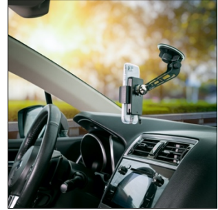
Steele Squeeze Windshield Kit

For more information about these Nite Ize products, visit NiteIze.com .